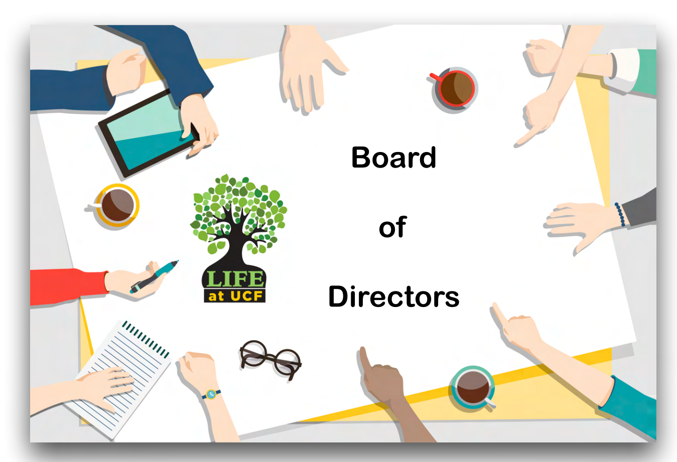
LIFE at UCF is looking for dedicated members to serve on the LIFE at UCF Board of Directors.

LIFE's Board guides the direction of the institute and focuses volunteer effort toward achieving LIFE'S strategic objectives.