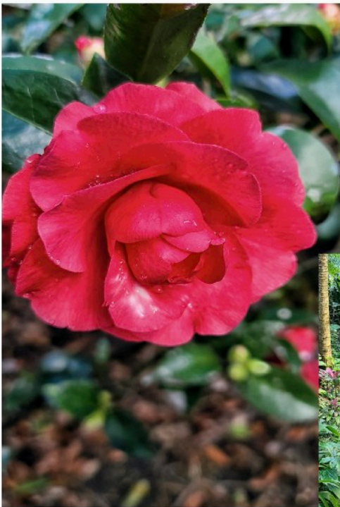
Camelias in abundance a babbling brook and

To make sure you are one of the FIRST to know about events when they become "live" on EventBrite, make sure you have clicked the button on the site that will notify you when new Trippin's are posted!