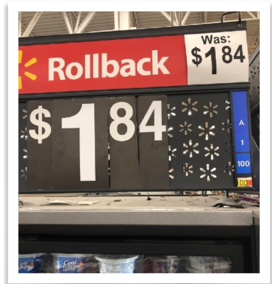
Better hurry! This sale won't last long!