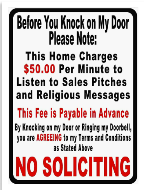
YEP....Available on Amazon for less than ten bucks!